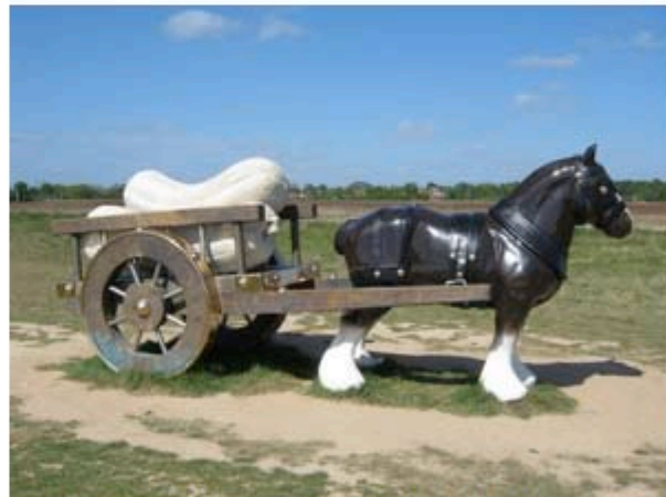
"Perceval" by British artist, Sarah Lucas on loan at Aldeburgh Music. In the background Snape Maltings Concert Hall, home to world-famous Aldeburgh Festival.

Lucas: I've always made works in plaster and concrete using a very rough kind of casting technique, beginning by casting some confusing bits of my body: arms and