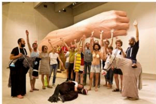
Sarah Lucas und Gelatin 2010

Lucas: I suppose it's obvious to say they developed out of the bunnies because they use the same materials. But in a strange way they developed out of Penetralia . That was the next thing to come along. There is something very organic and branchy and sprite-like about them. You start making something, and it suddenly jumps to life and it seems so clear that you can't believe you didn't see that years ago. I mean, there is no reason why I shouldn't have done something