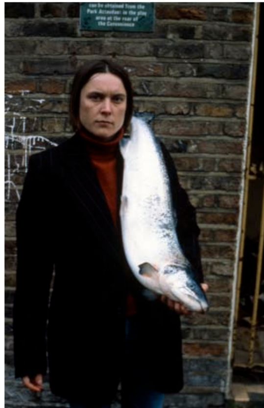
Sarah Lucas, "Got A Salmon On #3," 1997, Courtesy Sadie Coles HQ, London.